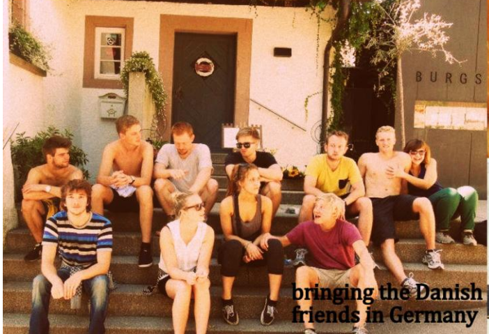
bringing the Danish friends in Germany