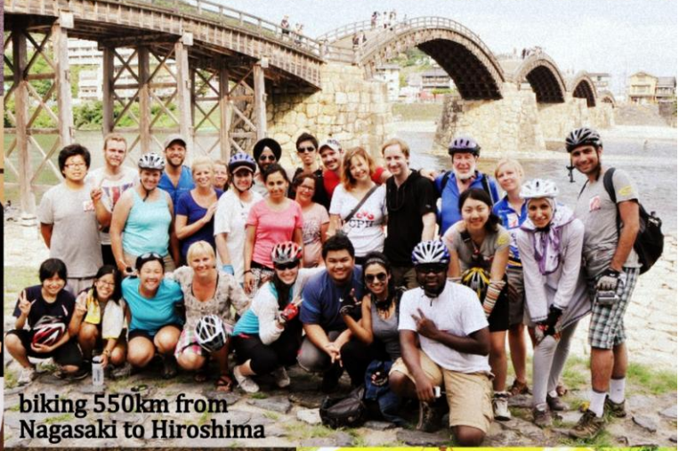
biking 550km from Nagasaki to Hiroshima