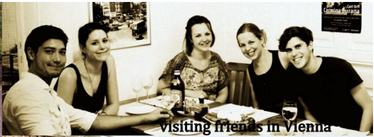
visiting friends in Vienna