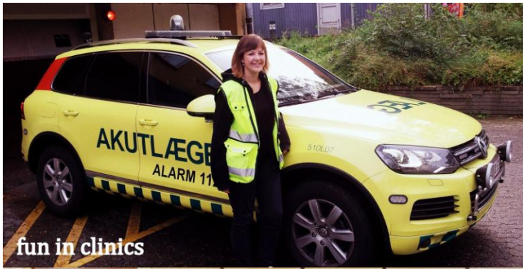
fun in clinics