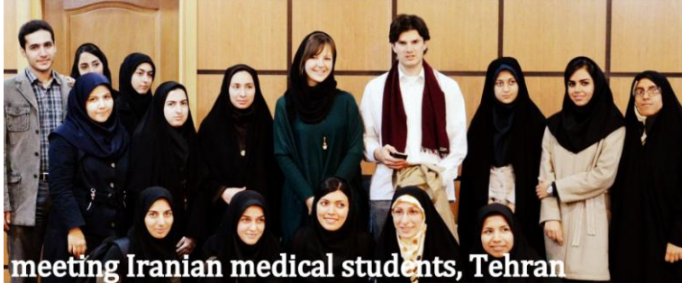
meeting Iranian medical students, Tehran