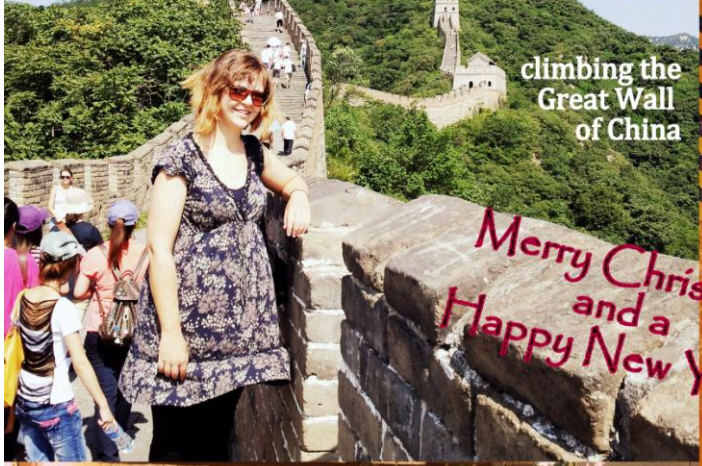
climbing the Great Wall of China